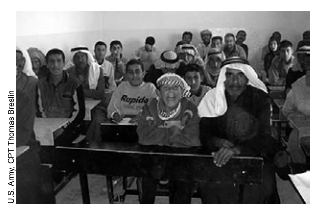
Students in class on first day of school on 26 January 2007, in Ar Ramadi, Iraq.

Jazeera Council, and by February 2007, the council included all the newly pacified tribes in the Jazeera area. Similar to the experience in Tal Afar, the goal of rapidly expanding the Iraqi Security Forces and conducting reconstruction projects was halted by the same problem of high illiteracy rates. The tribes embraced the proposed adult literacy programs with enthusiasm. By January 2007, the first adult literacy center opened in Jazeera with an enrollment of over 200 men and—most surprisingly—over 500 women.