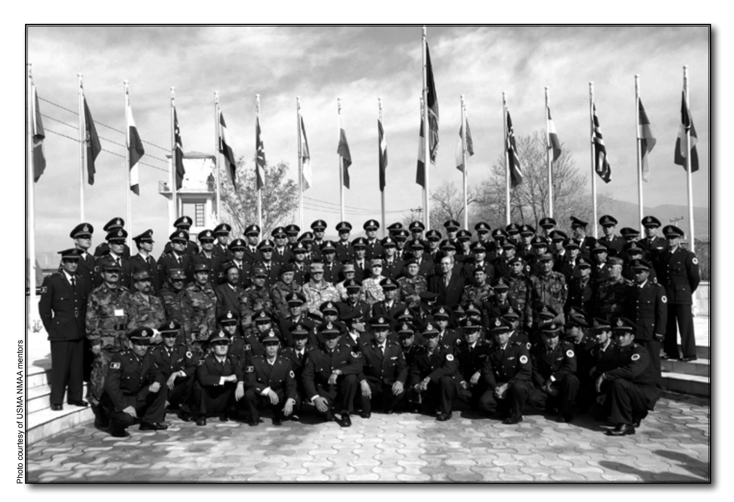
On 25 January 2009, the National Military Academy of Afghanistan graduated its inaugural class of 84 new lieutenants, with 64 joining the Afghan National Army and 20 joining the Afghan Air Corps. The academy, located in Kabul, has been continuously supported over the past four years by faculty mentors from the United States Military Academy at West Point and the United States Air Force Academy at Colorado Springs, augmented by active duty and reserve U.S. Soldiers and coalition units from around the world.